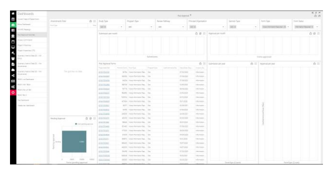
2 - You can filter dashboard to easily find the information you are after!