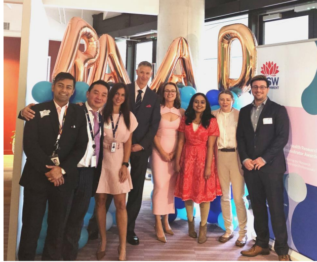
10 - The Research Ethics and Governance Unit (REGU) were proud to sponsor a range of events over September to show appreciation for the NSW Health Research Administrators.