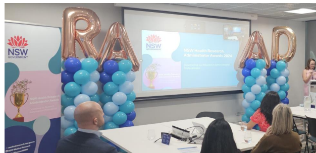
2 - Research Administrators Appreciation Day (RAAD)