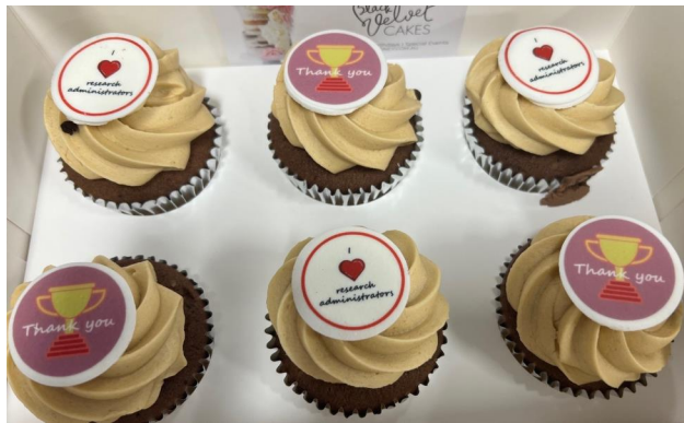
9 - It's not a party without cake.