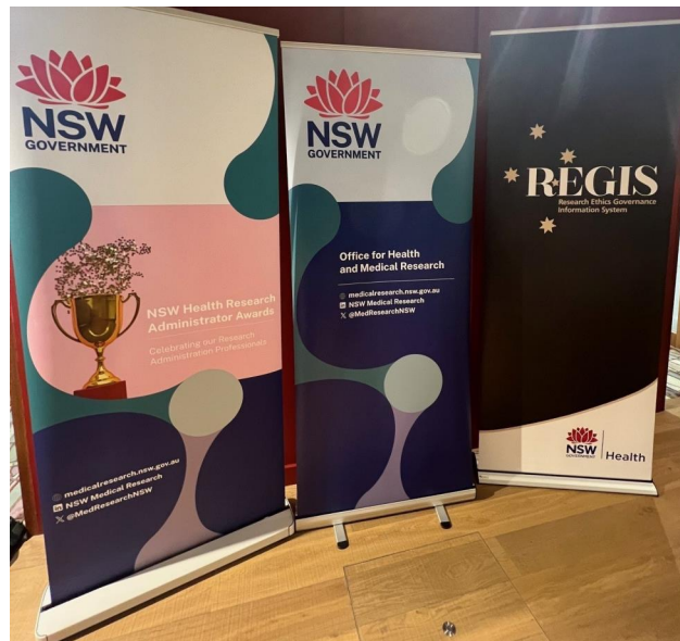
1 - Pink was the colour of the Award!

Read what our winners really think of being nominated and winning these awards.