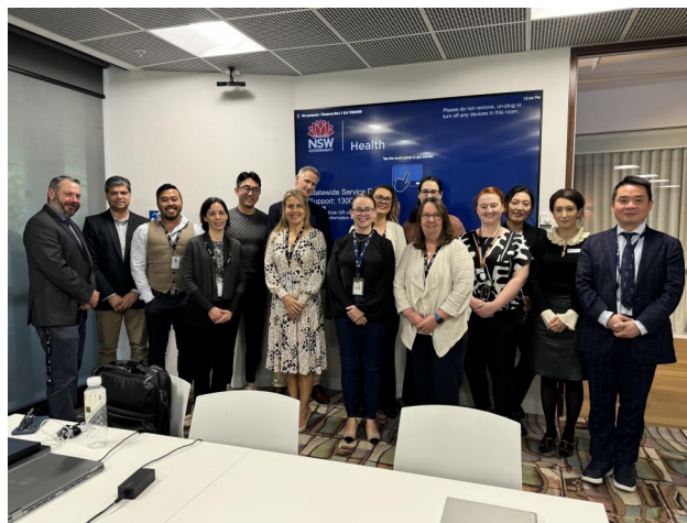
1 - Alpha Plus and NSW Health

NSW had a site visit with the Alpha Plus team on 1 and 2 October to discuss all things NOSS. It was a great couple of day's and we were excited to have some of our best "on the ground" representatives making sure Alpha Plus were taking their wants and needs into consideration.